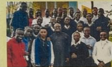
24 of 26 recent graduates from SAMS class of 2023 will continue their path toward the priesthood!