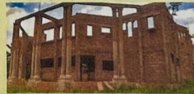
Construction of the new church in Nkanchi is continuing despite the ongoing conflict. Visit KumboKids.org for a full report.